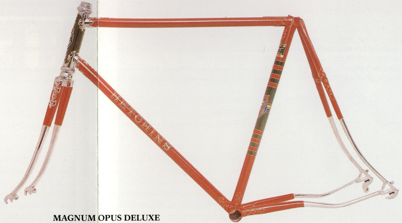
MAGNUM OPUS DELUXE