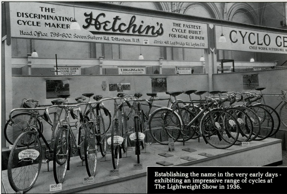
Establishing the name in the very early days - exhibiting an impressive range of cycles at The Lightweight Show in 1936.

The mid 1950's and stage racing is becoming a recognised part of the British cycling scene. At that period, Hetchin's and the Romford R.C. enjoyed a close tie up; the photograph shows one of their riders taking the "first into Scotland" prime during the Tour of Britain.